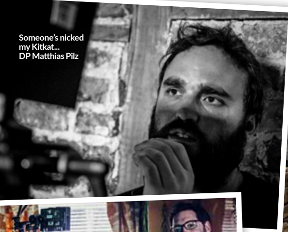
Someone's nicked my Kitkat...